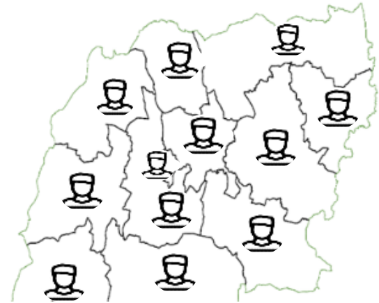
Part 2: Warding Arrangements