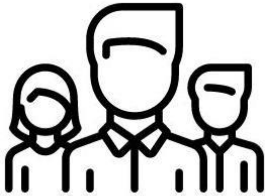
Part 1: Councillor Numbers