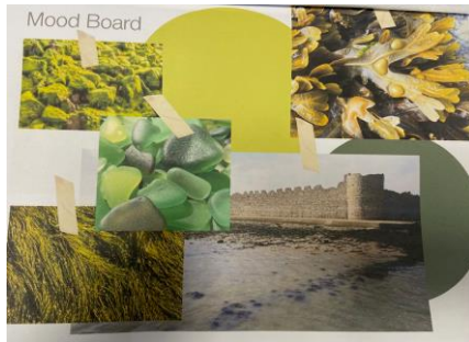
Colour Palette Overview