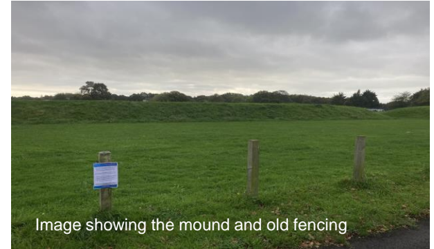
Image showing the mound and old fencing