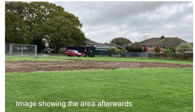
Image showing the area afterwards